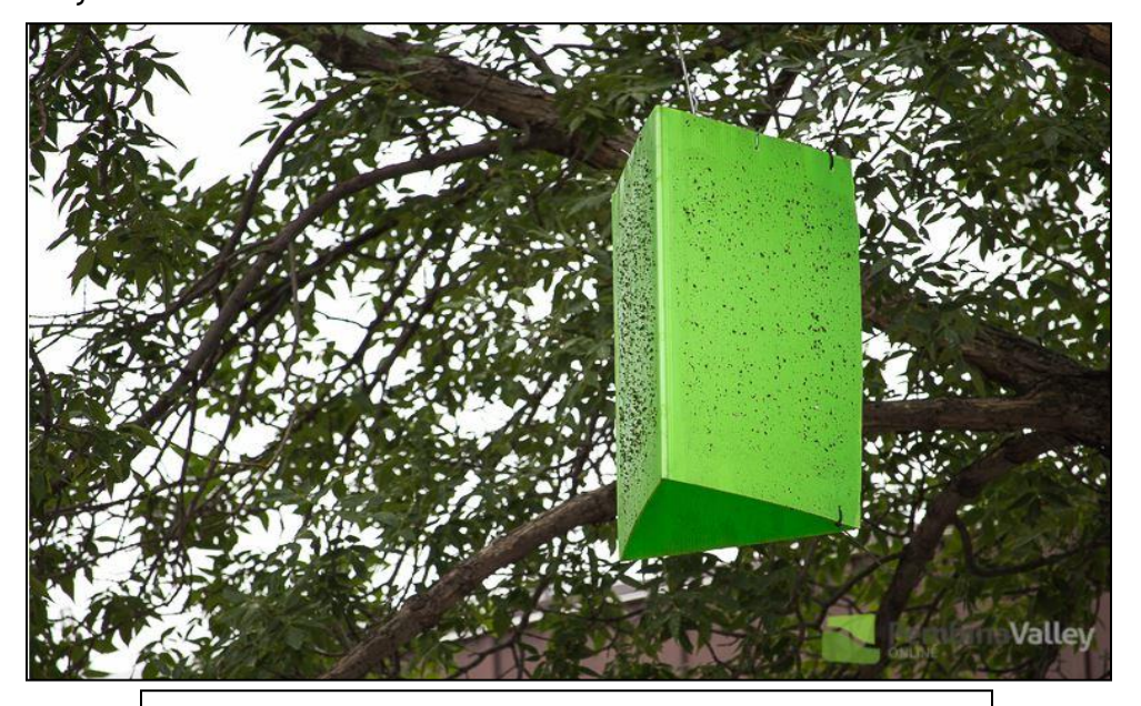
Example of an Emerald Ash Borer Canopy Trap

Carter is currently working on a report which details the methodology and results of the project, but initial trapping efforts resulted in fifty (50) EAB beetles being caught by canopy traps throughout Bay County this summer. This data proves the lingering presence of EAB throughout Bay County and supports the need for continued treatment of publicly owned critically endangered ash trees in order for them to continue to thrive and grow, providing value in many forms to local residents.